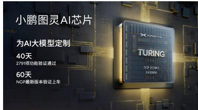
图2 小鹏图灵 AI 芯片