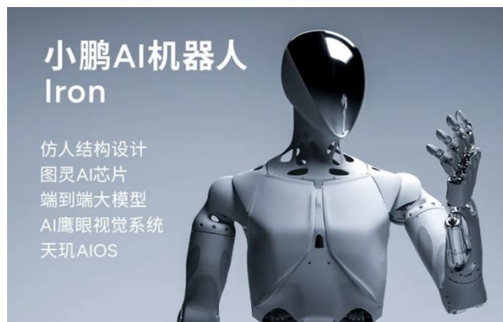
图5 小鹏图灵 AI 机器人 Iron

在 AI 机器人领域，小鹏推出的 AI 机器人更加像人，尺寸上用的是 1:1 类真人尺寸和比例，“大脑”采用图灵 AI 芯片，能够像人一样思考记忆，同时也让手脚自主活动，双手也采用 1:1 人类双手尺寸，有 15 个双手自由度，身体上也有 62 个自由度。小鹏 AI 机器人与智驾体系同源，采用了 AI 汽车上的鹰眼视觉系统，可以 720° 无死角看世界。还运用了端到端大模型和强化学习算法，让机器人行走有像驾驶般的能力。