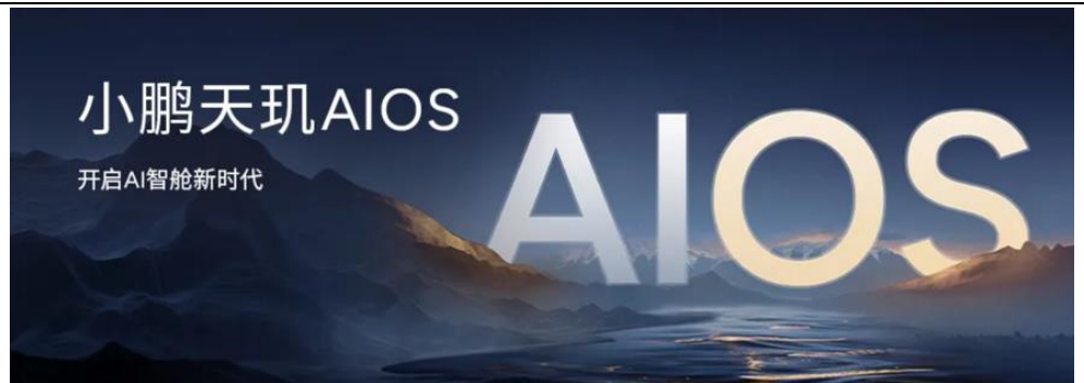
图3 小鹏天玑 AIOS

在小鹏 AI 科技日上，小鹏汽车正式发布小鹏天玑 AIOS。不同于传统的座舱架构仅采用单颗座舱芯片，小鹏天玑 AIOS 将基于自研的图灵 AI 芯片，由 2 颗芯片同时驱动。基于此，AI 算力相比传统智能座舱提升了 20 倍，CPU 算力也提升了 20 倍。为了实现类 GPT-4o 大模型上车的目标，小鹏天玑 AIOS 还将百亿参数大模型部署在本地，实现更自然、无感的人机交互。