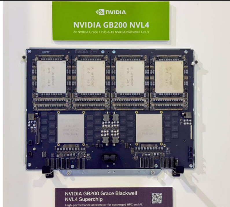
图2 GB200 NVL4 超级芯片实物图